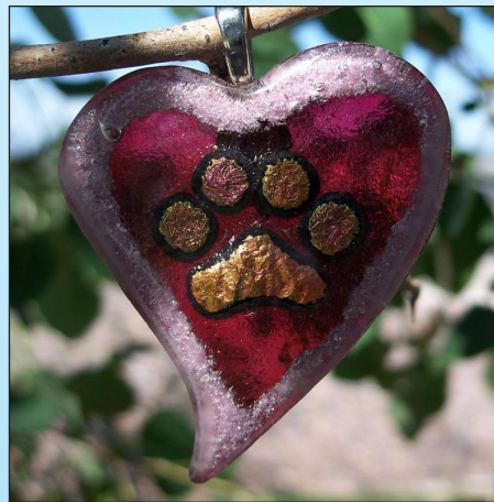
Glass Weeping Heart Pendant by Pet Memorial Glass Jewelry

As we mentioned last time, people are rarely able to make rational decisions when they have just lost a pet. By deciding now on whether you want to bury or cremate your pet, you will know what you want for your pet when the time comes.