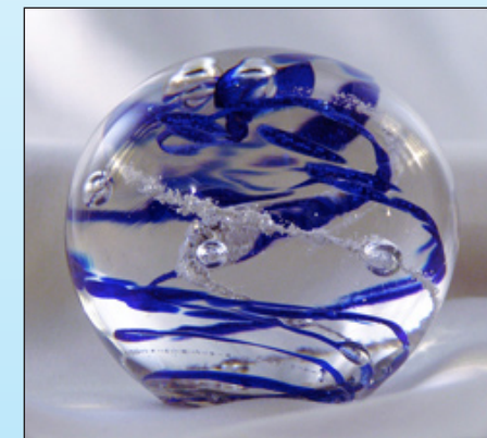
Memory Sphere by HeartGlass Studio

a shelter kennel will be permanently marked with a plaque bearing a name, image and several lines of text. Other possibilities include an inscribed Lucite tile on the friendship wall for $100 donation, ceramic paw print tiles on the Promise Wall (Quebec Street) or Buddy Wall (Castle Rock) for a $250 donation or a ceramic photo tile on the Photo Wall. For these and other ways to remember your human or canine loved one, please call DFL at 303-751-5772, ext. 7227. All proceeds from DFL memorials and tributes are used to care for pets at the shelter. What a wonderful way to remember your pet.